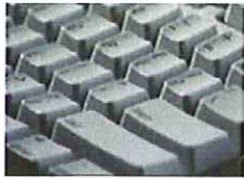
Keyboards, cables, mice, etc.