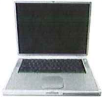
Computer monitors, Laptops, etc $5