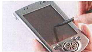
Cell phones with video displays