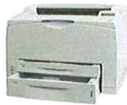
Printers, scanners, fax machines