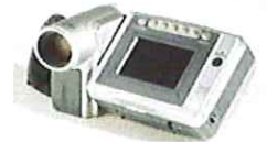
Cameras & recorders with video display